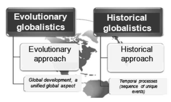
Fig. 2. Historical and Evolutionary Globalistics

Thus, Historical Globalistics is rather a description and, to a certain extent, a temporally ordered reflection of the world dynamics of human existence whereas Evolutionary Globalistics is the study of evolution and coevolution of global processes and their systematical synergetic phenomenon – global development.