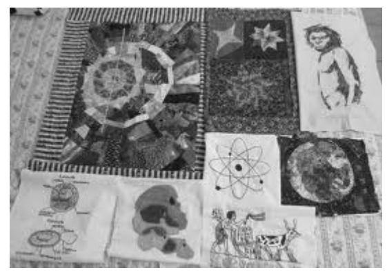
Fig. 2. Big History quilt

This is a photograph of the 'Big History quilt' (Fig. 2) and an excerpt from the accompanying blog (Fig. 3). It is appropriate and necessary to discuss student learning, approaches to curriculum frameworks, and pedagogies from theoretical and large-scale perspectives. However, the most meaningful enactment of all this discussion and decision-making plays out in the experience of an individual student. This is one such example.