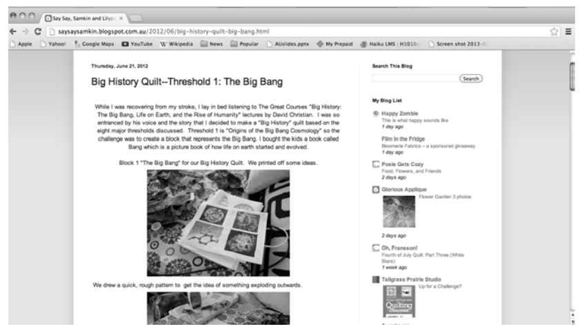
Fig. 3. Big History Quilt blog