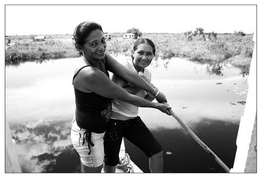
Fig. 6. Two residents of the community of Santa Maria on the Uruará River, a tributary of Amazon in the state of Pará, Brazil. They are heading to a community meeting to discuss actions to be taken against illegal deforestation and logging companies stealing timber from their land.

It is not that this exercise in 'heritage sorting' is so earth-shakingly important. I cite it to show that such a revisioning of the world can happen and that we can then make decisions in our own lives and in our own communities without waiting for governments, corporations or NGOs to act. We can do it ourselves, right now. It will not save the world, but it will start the process.