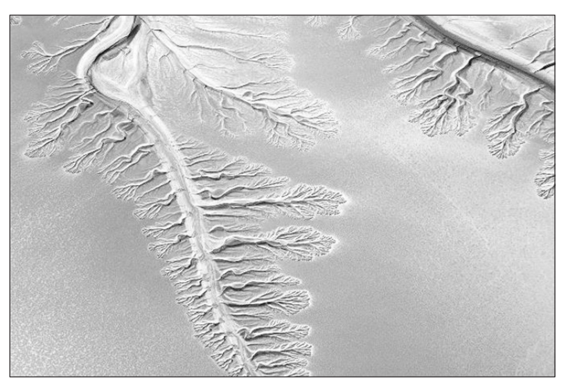
Fig. 5. The Colorado River delta, which ends as a dry riverbed in the Sonoran Desert of Baja California (Mexico), 8 kilometres north of the Sea of Cortez. Photograph by Peter McBride, US Geological Survey, 12 January 2009.