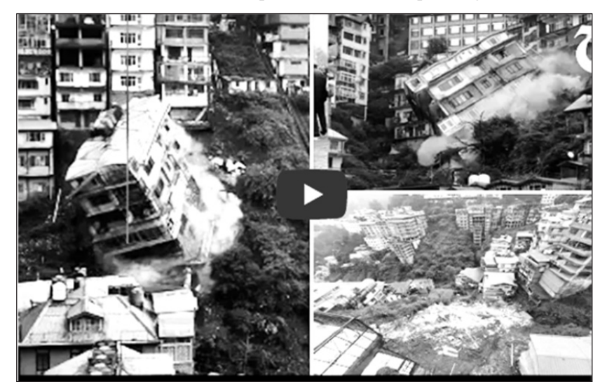
Fig. 4. Collapse of an eight-story building in Shimla, 30 September 2021. Video by Amit Kanwar. Bhanu Lohumi, 'Multi-Storey Building Collapses in Shimla. Source: Tribune News Service (Chandigarh, Haryana) 30 September 2021: URL: https://www.tribuneindia.com/news/himachal/multi-storey-building-collapses-in-shimla-no-loss-of-life-318316.

ary at the Sea of Cortez runs dry. This situation is destroying biomes throughout the south-west region of North America and is compounded by droughts and floods of the climate crisis, wildfires and mudslides, pollution and other spiralling events (Owen 2015).